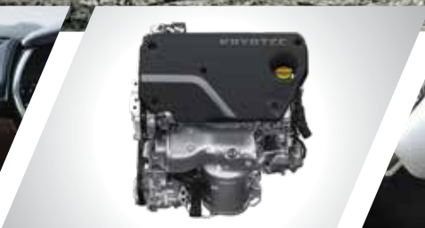
Class Leading Performance and Drivability Cutting Edge 2.0L Kryotec Diesel Engine