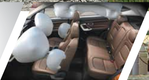
Top-of-the-Line Uncompromised Safety 6 airbags, ABS with EBD, ESP with added functionalities