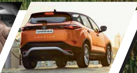
Stunning Impact Design 2.0 Extraordinary Exteriors and Luxurious Interiors