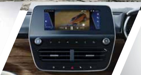
Future Ready Connectivity and Infotainment Floating Island 22.4 cm (8.8 in) Touch Screen Infotainment with JBL Acoustics